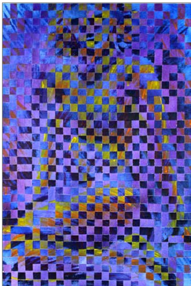
Light and Shadow #2