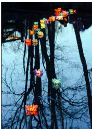
Dawn Whitmore's Gracies Gown Reflecting Lanterns