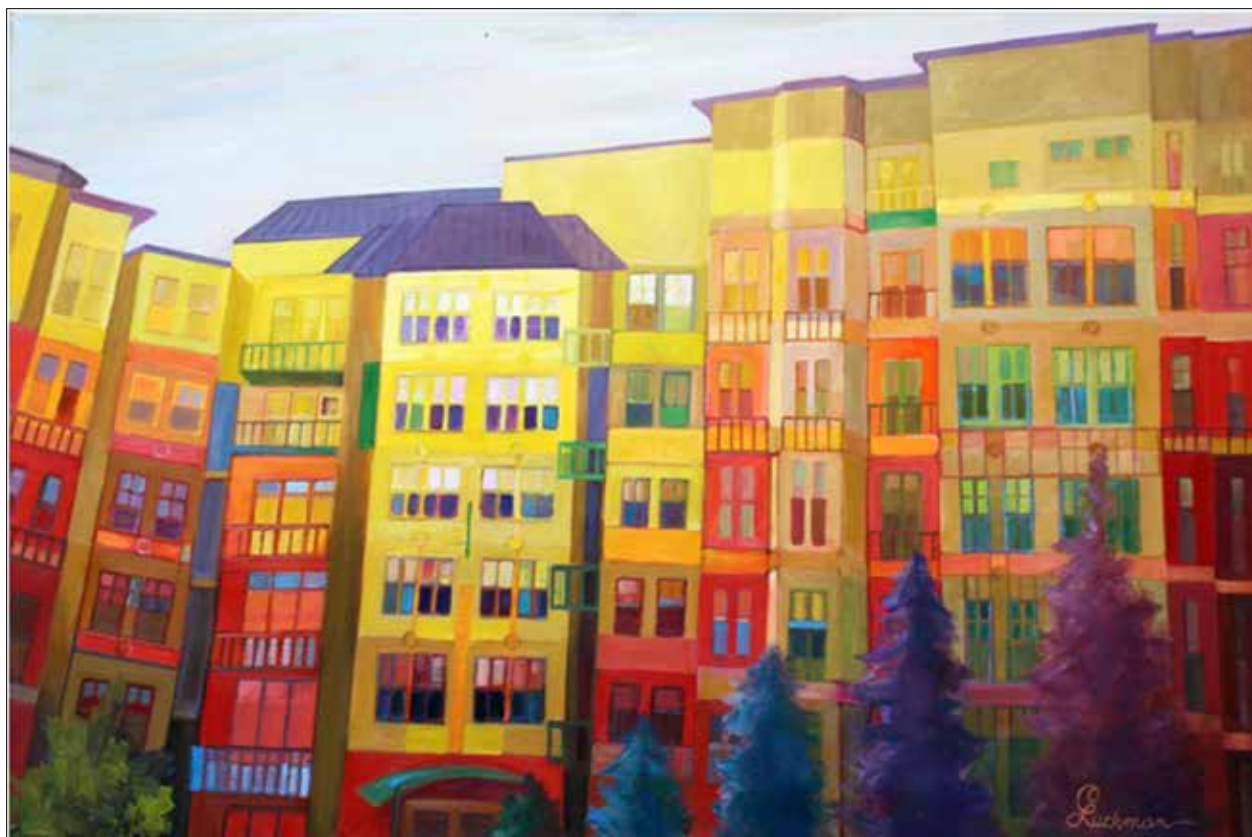
The Grand Color Game I

Oil on canvas by Chris Luckman, Celebrate Color & Light National Exhibit, July 2017.