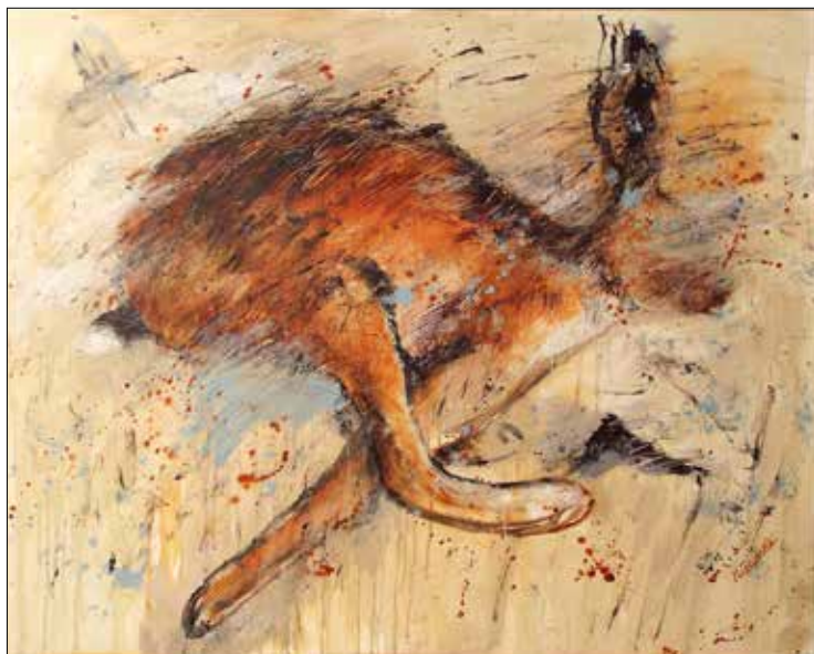
At Full Tilt

Oil by Charlotte Richards, Touch of Blue Exhibit, November 2016.