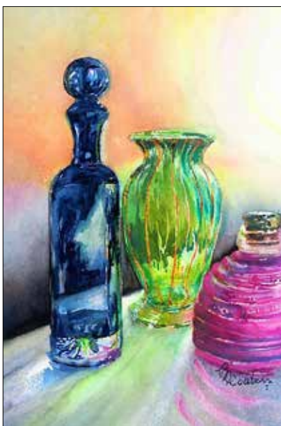
Beverley C. Coates