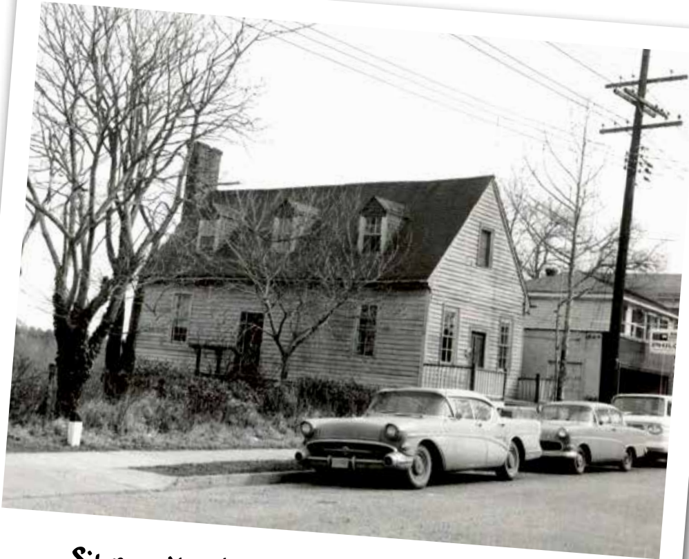
Silversmith House, c. 1963