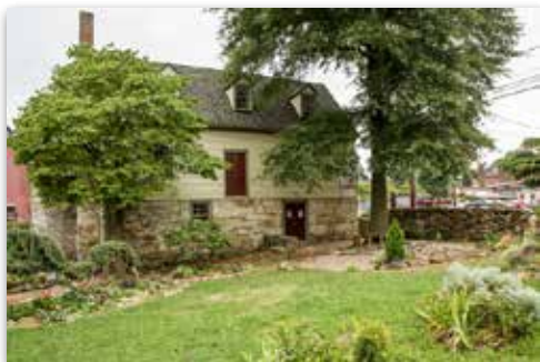
Silversmith House, c. 2013