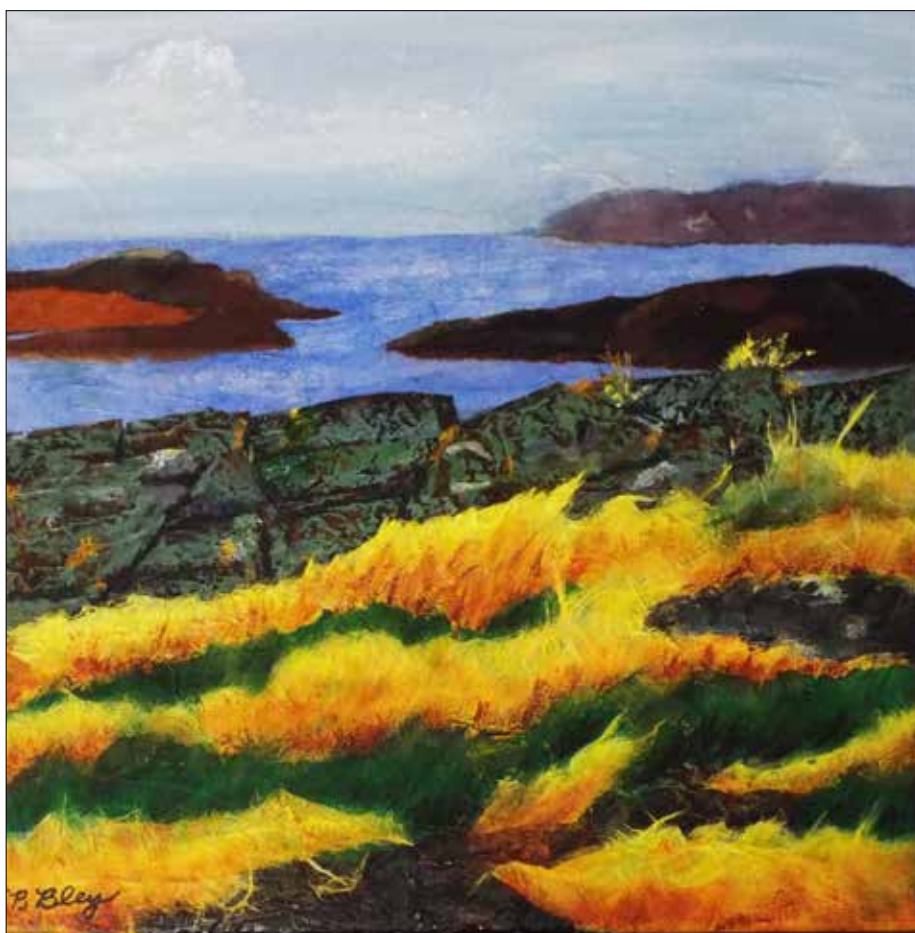
Grasses of the Maitimes