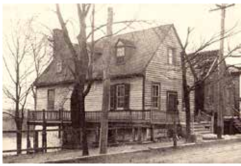
Silversmith House, c. 1929