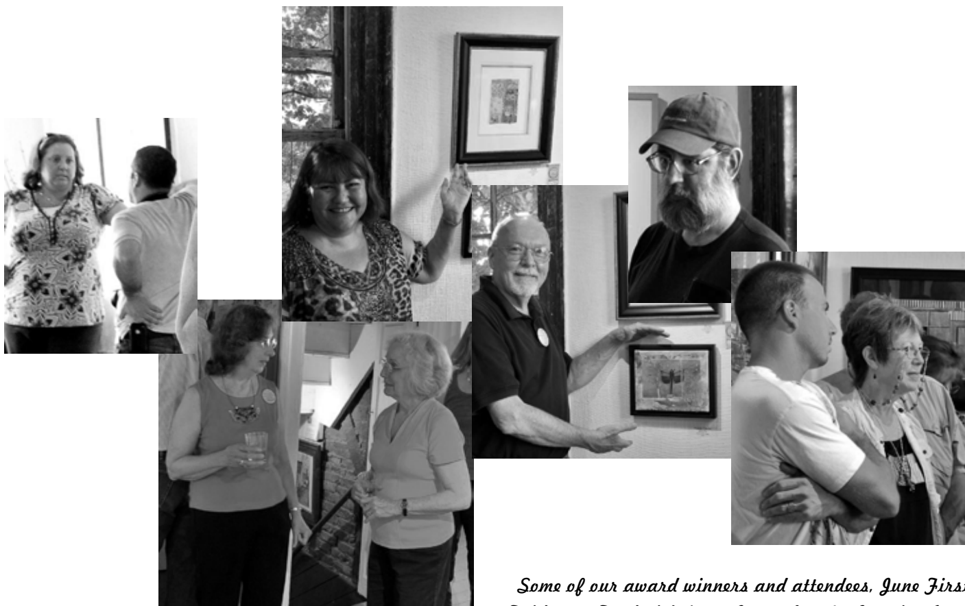
Some of our award winners and attendees, June First Friday at Fredericksburg Center for the Creative Arts.