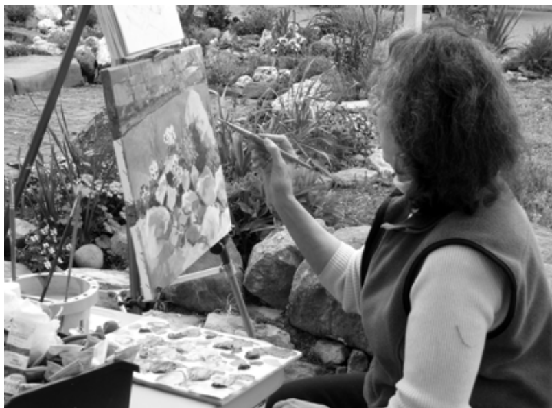
Work in progress at plein aire session

Enjoy creating your own, unique 12x12-inch mosaic wall hanging using a variety of goodies. Students may use materials provided or bring their own collections of stones, shells, glass, etc., for their designs. Handouts provided. Experimenting with composing a mosaic from natural found items will teach you something about mixed media and how to add an artistic, creative look to your unique work of art!