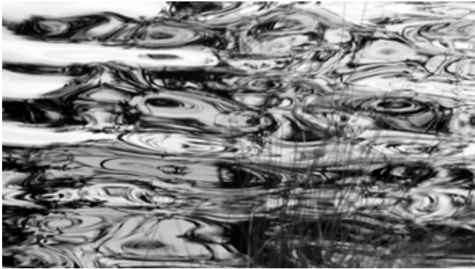
Sandy Skipper Aug Members' Gallery Artist Virginia the Beautiful

For her first large solo exhibition Skipper wanted to highlight the natural allure of the “Old Dominion State,” the premise being that you do not have to visit an exotic place to find beauty; in fact you can find it without leaving Virginia. While shooting these photographs, Sandy tried to capture the gravity-defying grace of butterflies and the expressive personalities of dragonflies as well as birds of the Eastern Shore. She experimented with taking shots of the moving water of streams, rivers, an ocean and a bay with various and surprising results. Sandy photographed one of eight covered bridges in the state along with a mill that began operation in 1794. Troubleshooting the fog on the Skyline Drive journey was a fun challenge. Her goal was to provide a unique perspective of familiar scenes in addition to including some unexpected places and creatures. There will be a contest during the Virginia the Beautiful exhibit. Visitors to FCCA will have a chance to guess where in Virginia the photograph “Along for the Ride” was taken. A winner will be randomly selected from the entries with the correct answer. The prize for the contest is an 11x14 print of “Along for the Ride.” The purpose of the contest is to help draw awareness to the arts in Fredericksburg and to introduce people to the Fredericksburg Center for Creative Arts.