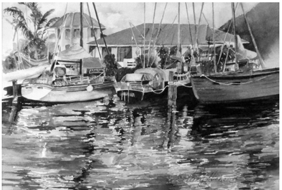
"Island Harbor," watercolor by Penny Hicks of Fredericksburg, VA