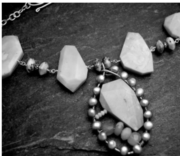
"Blush," sterling, Peruvian opal and yellow turquoise necklace by Dee Antil, Fredericksburg, VA

Anticipated return shipping: Monday, April 2