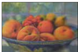
Second Place Still Life w/Peaches, photograph by Fritzi Newton , Fredericksburg, VA