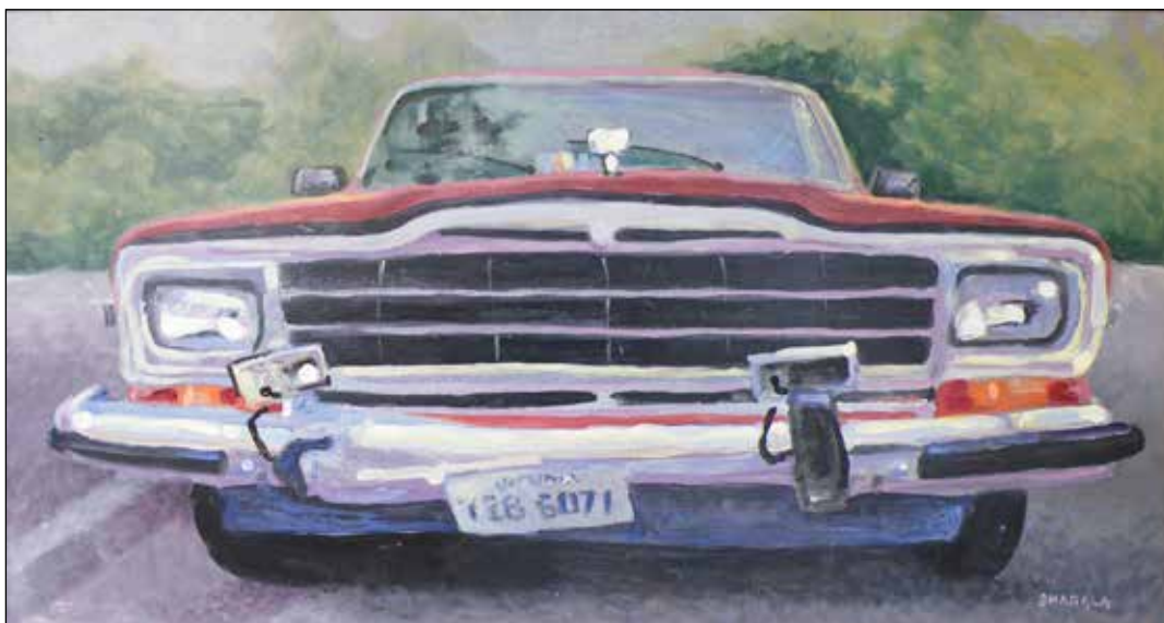
Still Running Acrylic by Tom Smagala, Gears, Gadgets & Gizmos Exhibit , July 2012