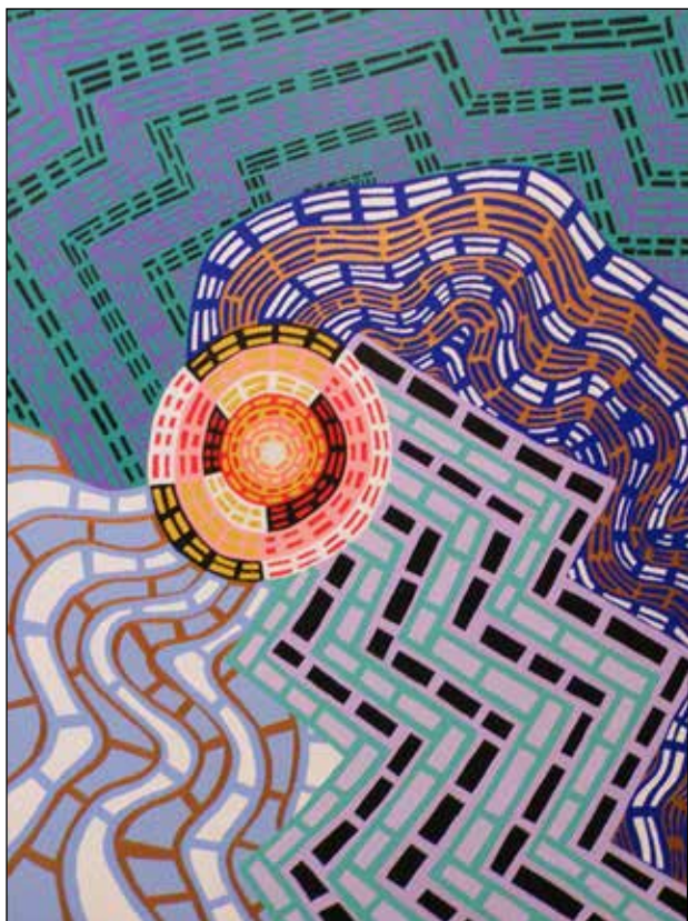
Overview Acrylic by Joseph Cummings, Gears, Gadgets & Gizmos Exhibit, July 2012