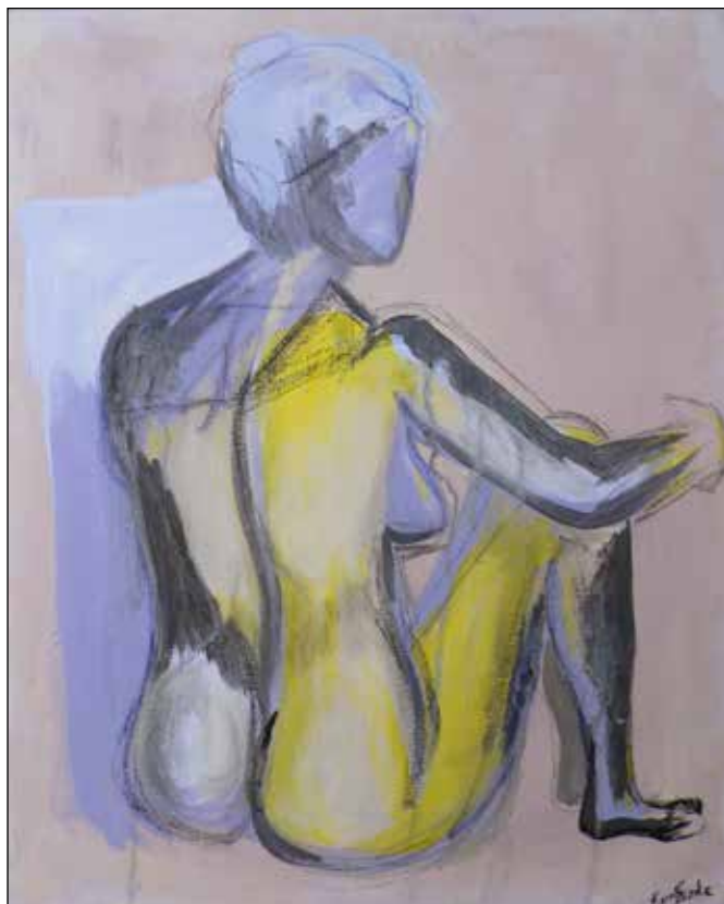
Figure 3 Mixed Media by Kerry Steele, Regional Exhibit, June 2012