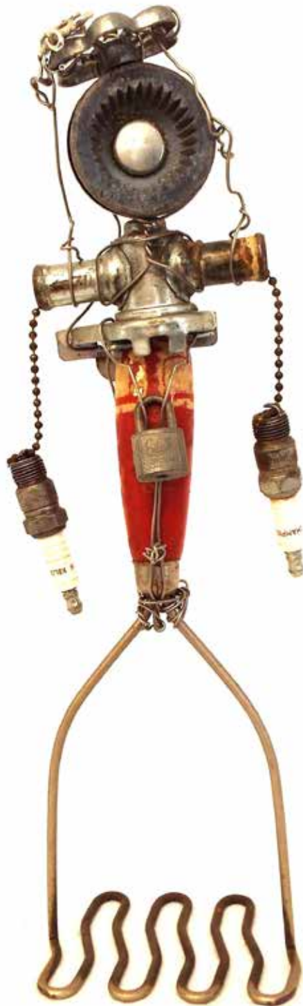
Smashing Attitude 3-D sculpture by Pam Weldon, Regional Exhibit, April 2015.