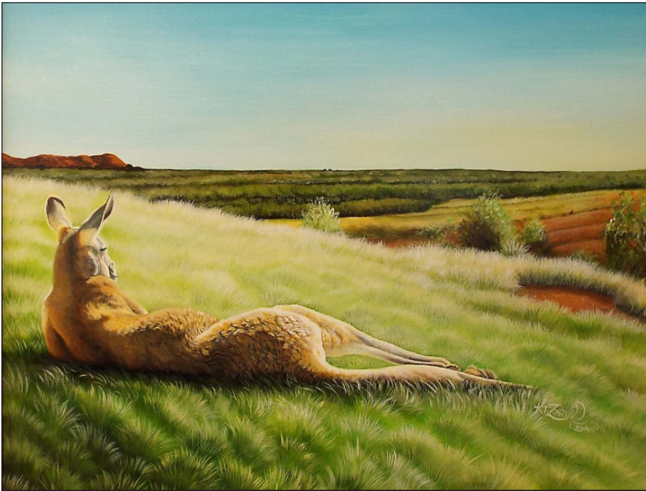
Laid Back —Acrylic on Canvas by Kristl Zerull