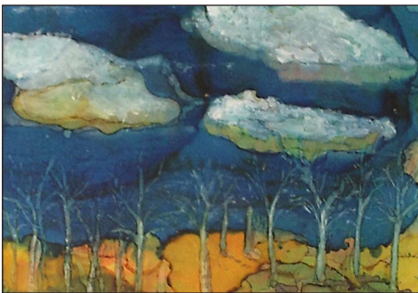
Cloudy Day —Alcohol Ink by Suzi Bevan