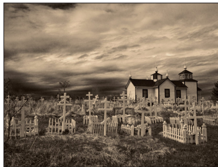
At Rest in Ninichik