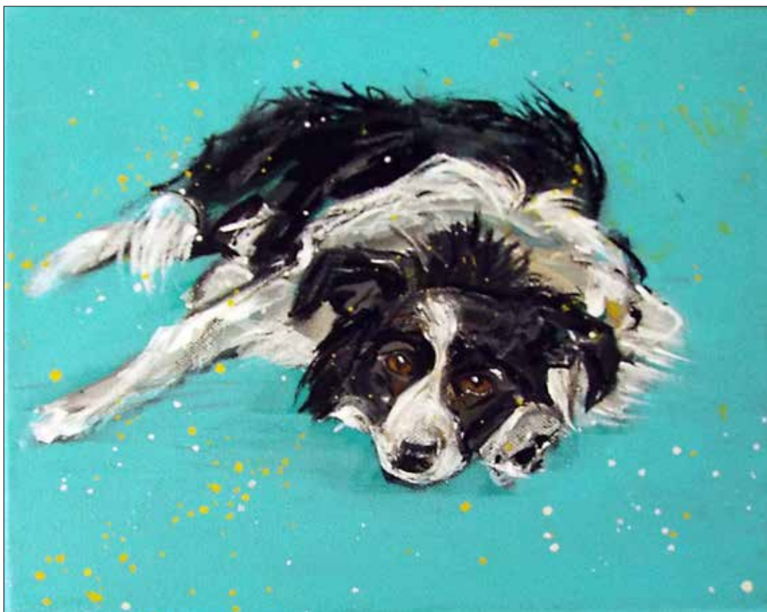
Phoenix - Acrylic by MG Stout, Tranquility Exhibit, November 2017.