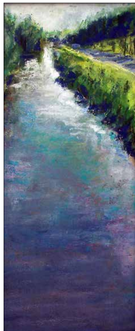
Exhibit dates: Sept. 29 – Oct. 26 Juror: TBD Entries deadline: Sept. 14, by 5 p.m.