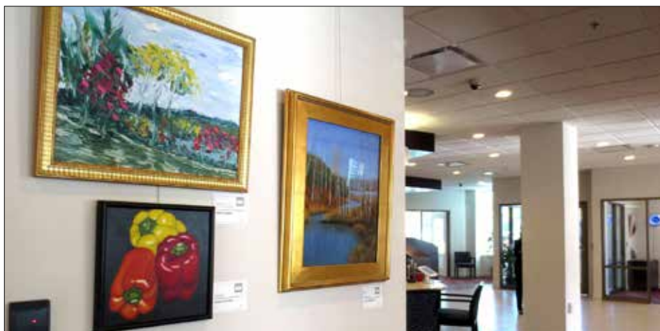
Paintings in the CBTC lobby are just three of 35 on display through Jan. 26.