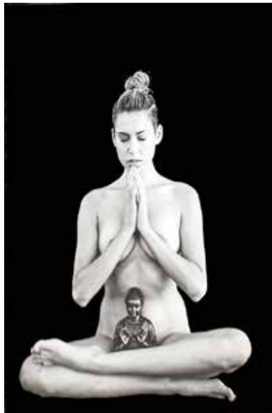
Second Place: Meditation , photograph by Saeed Ordoubadi , King George, Va.