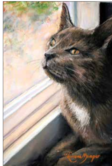
Elizabeth Hood's Piney River Magic and Lorraine Momper's Birdwatching Cat are two of many pastel paintings on display until Oct. 26.