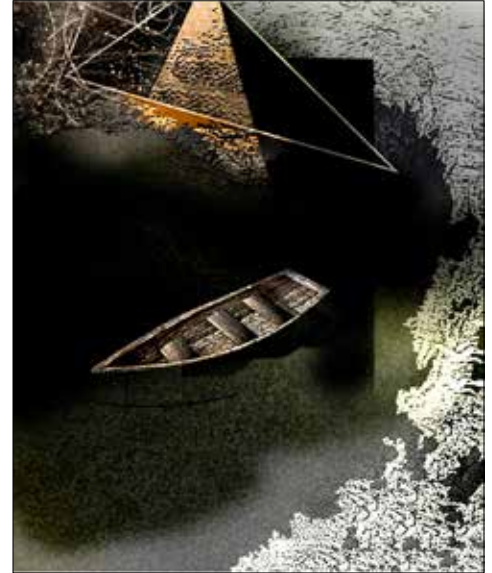
Third Place: Transmigration , archival pigment print by Robert Hunter , Colonial Beach, Va.