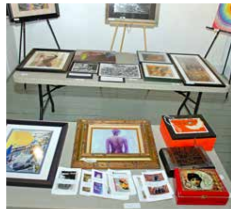
Donated art for FCCA silent auction raised $900 during the annual meeting, Oct. 21.

FCCA still has board positions to fill: President, Building and Grounds, and Grants and Fundraising. If you are interested in volunteering in a leadership position contact a current board member or call the Docent Desk at 540-373-5646.