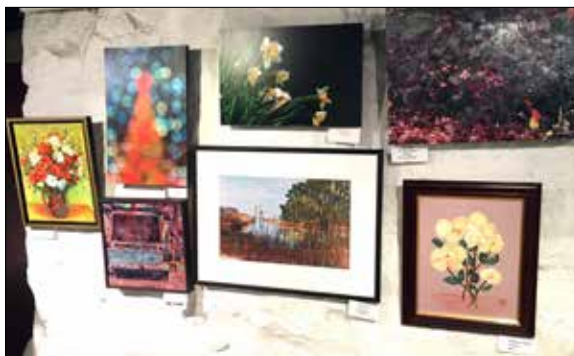
Just a sample of the many works for sale.