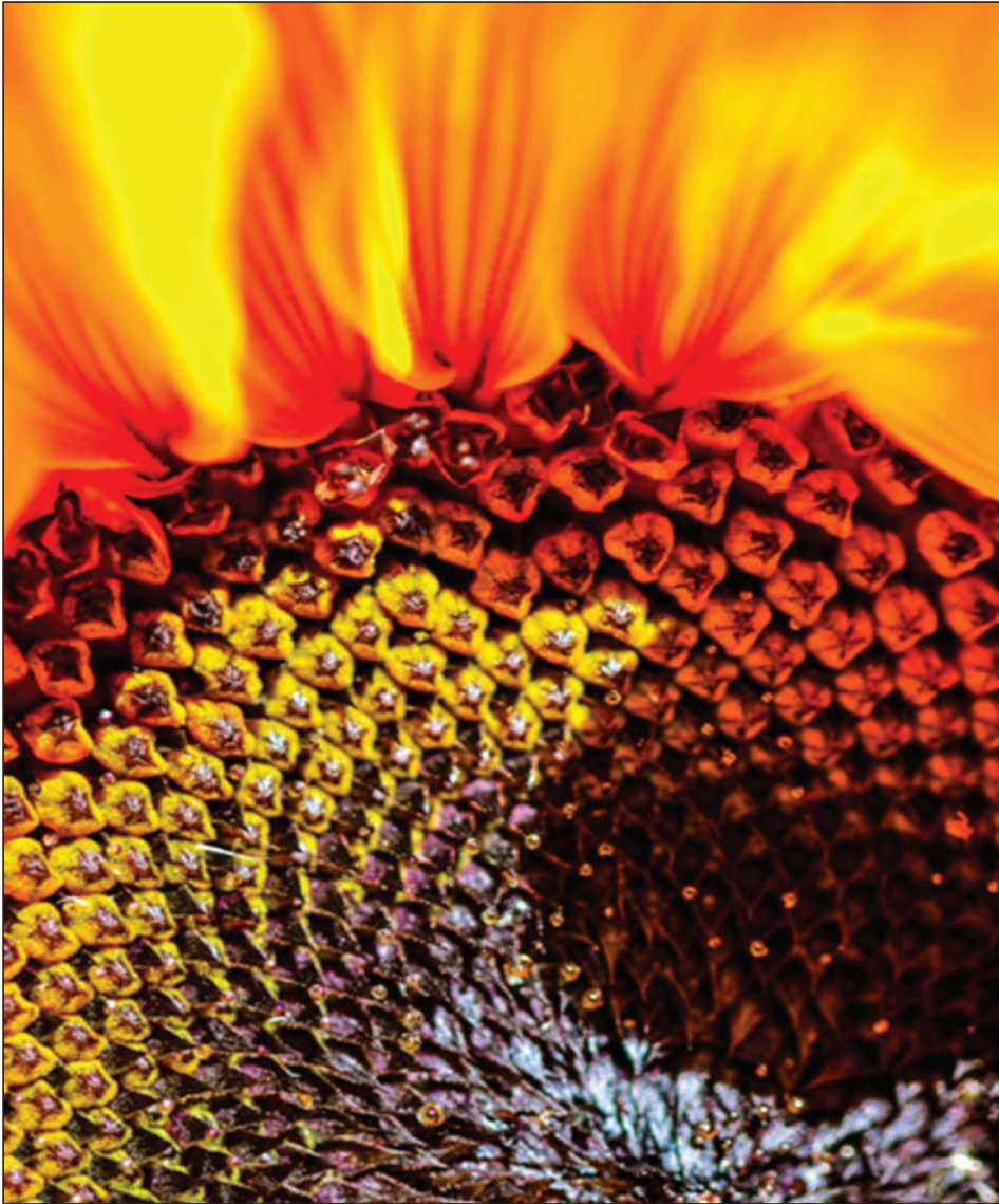
On Fire—Digital Photography by Saeed Ordoubadi