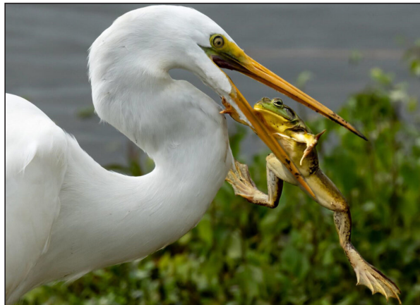
One of Those Days