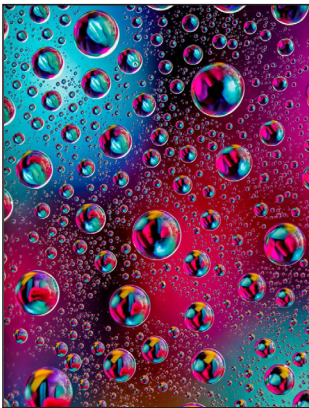
Colorful Bubbles