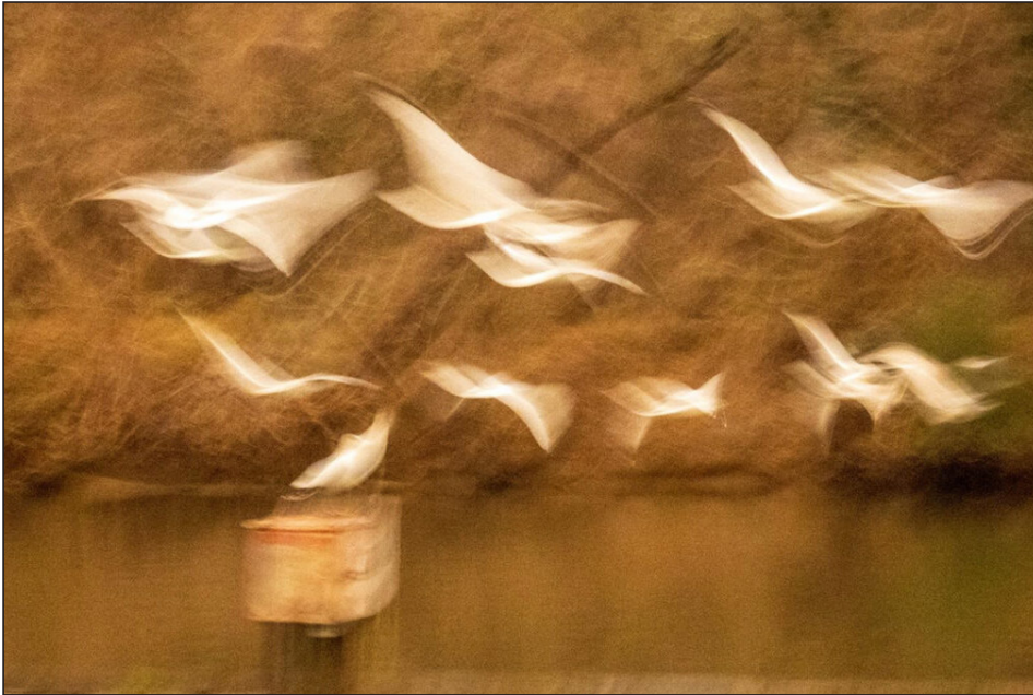
Poetry at City Dock