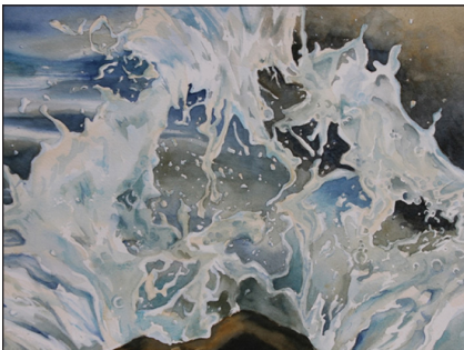
Water Exploding upon the Rocks — Watercolor by Amy Browning