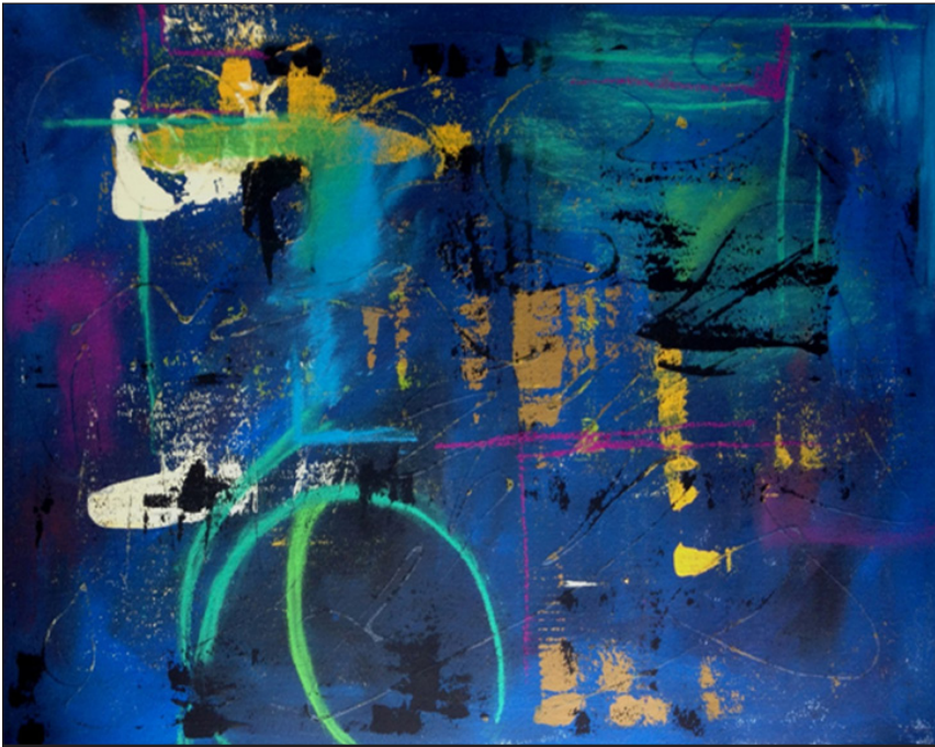
Co[in]cide —Mixed Media by Stacey J. Schultze