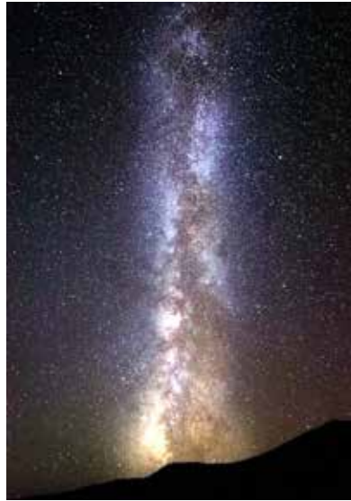
2nd Place: Milky Way, Fredericksburg, Va