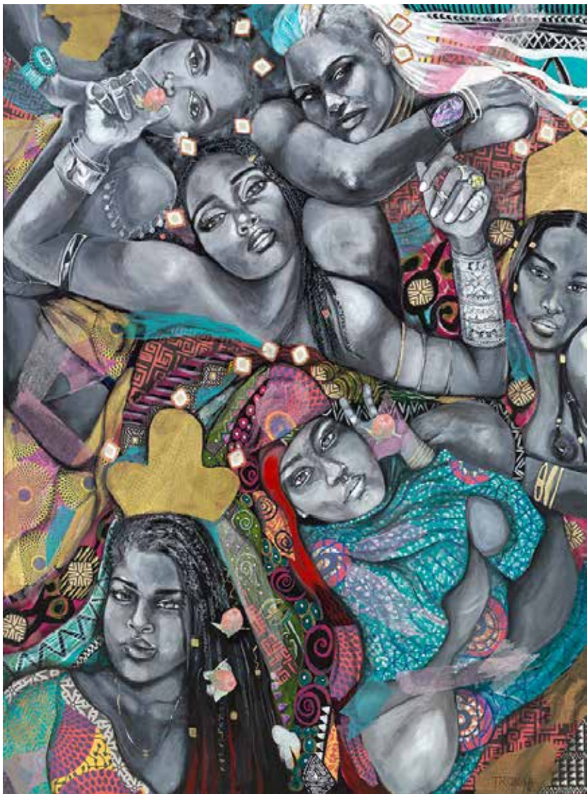
Daughters of the Dust, above. Barren One and Many Are My Daughters, top right.

To give meaning and power to attributes of life that we may take for granted. To be able to accentuate characters, events, and ideas, to such an extent, that it can change the way people perceive it forever. That ability is only possible with art, and that's why I have dedicated myself to pursuing this beloved magic.