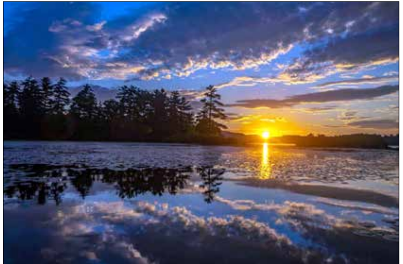
1st Place: Sunrise