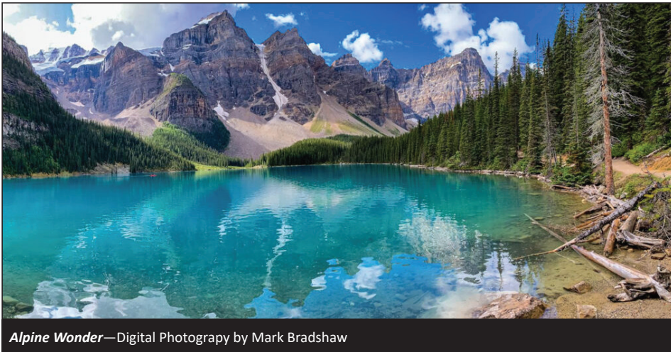
Alpine Wonder —Digital Photography by Mark Bradshaw

Featured in the Members' Gallery Celebrating Black Artists