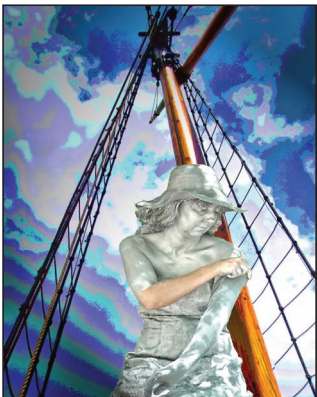
Sail on Silver Girl