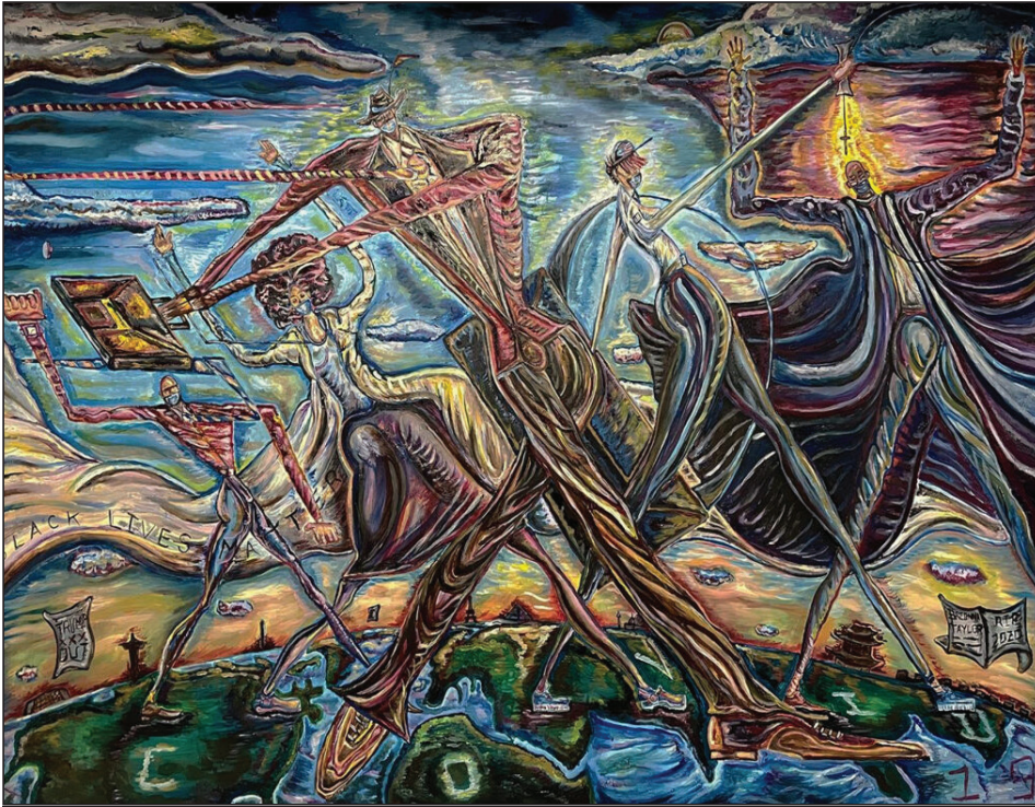
RIP 2020—Oil on Acrylic on Wood Panel by Donavan Lyons