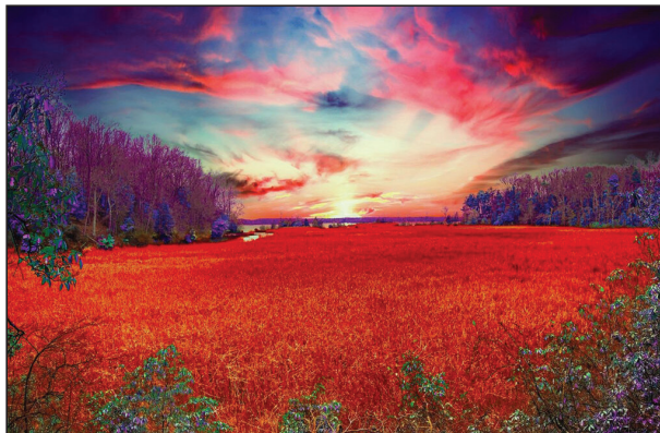
The Crimsom Moor—Digital Art from Photo Collage by Mark Bradshaw