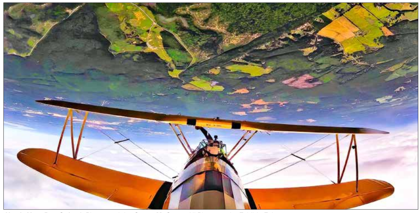
How's Your Day Going? Photograph by Gregg McCrary, All Photography Exhibit, February.