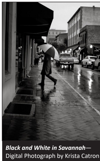
Black and White in Savannah