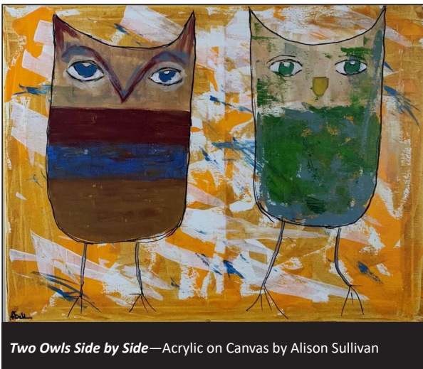
Two Owls Side by Side—Acrylic on Canvas by Alison Sullivan