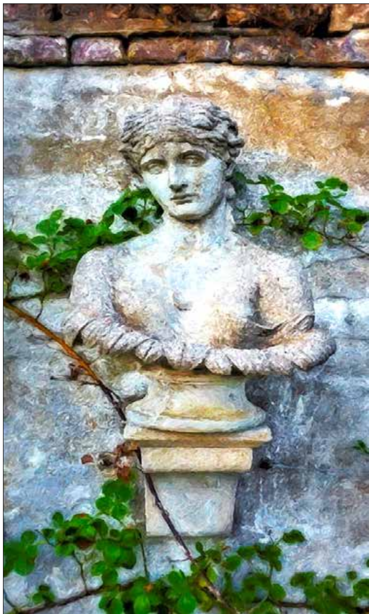
Lady of Chatham

Artist Choice Exhibit, April 2021.