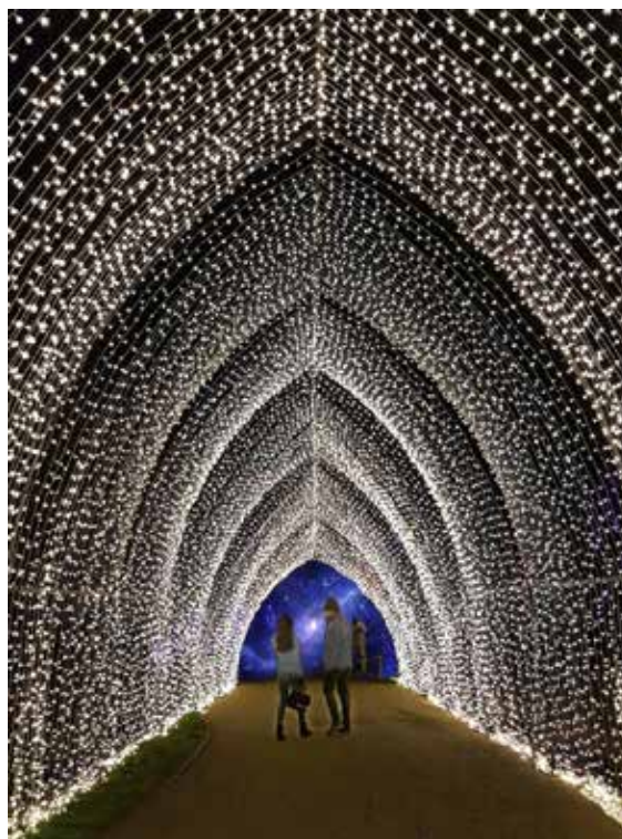
2nd Place: The Cathedral Lights and Beyond