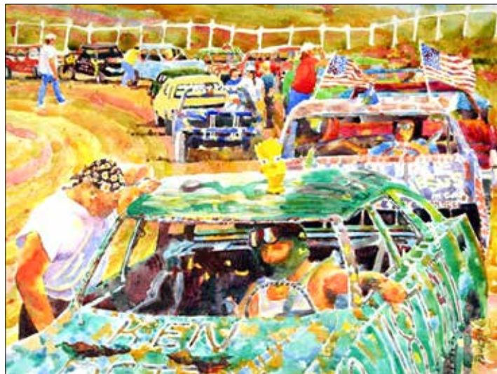
2nd Place: Lining Up for the Demolition Derby, watercolor by Kit Paulsen , Fredericksburg, Va.