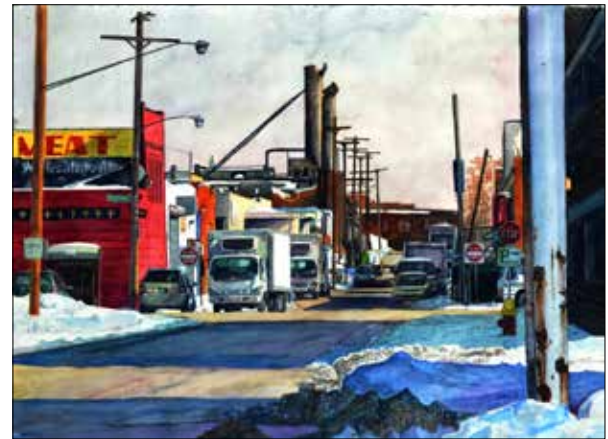
2nd Place: Eastern Market, watercolor by Keith Beale , Burke, Va.