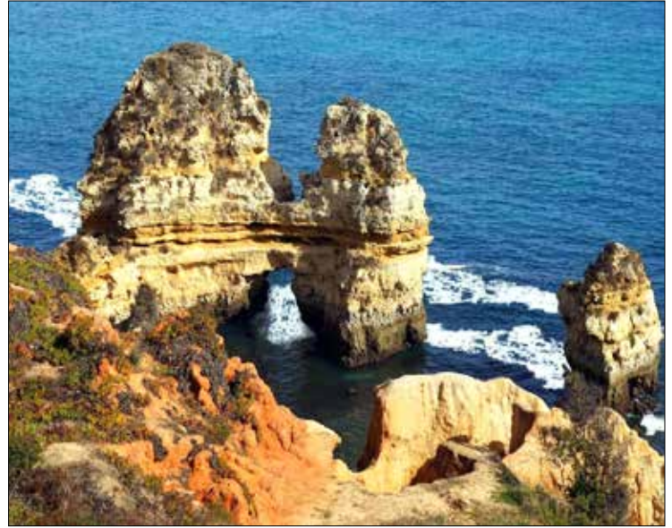
2nd Place: Cabo da Roca, metallic photograph by Deborah Herndon , Valparaiso, Ind.