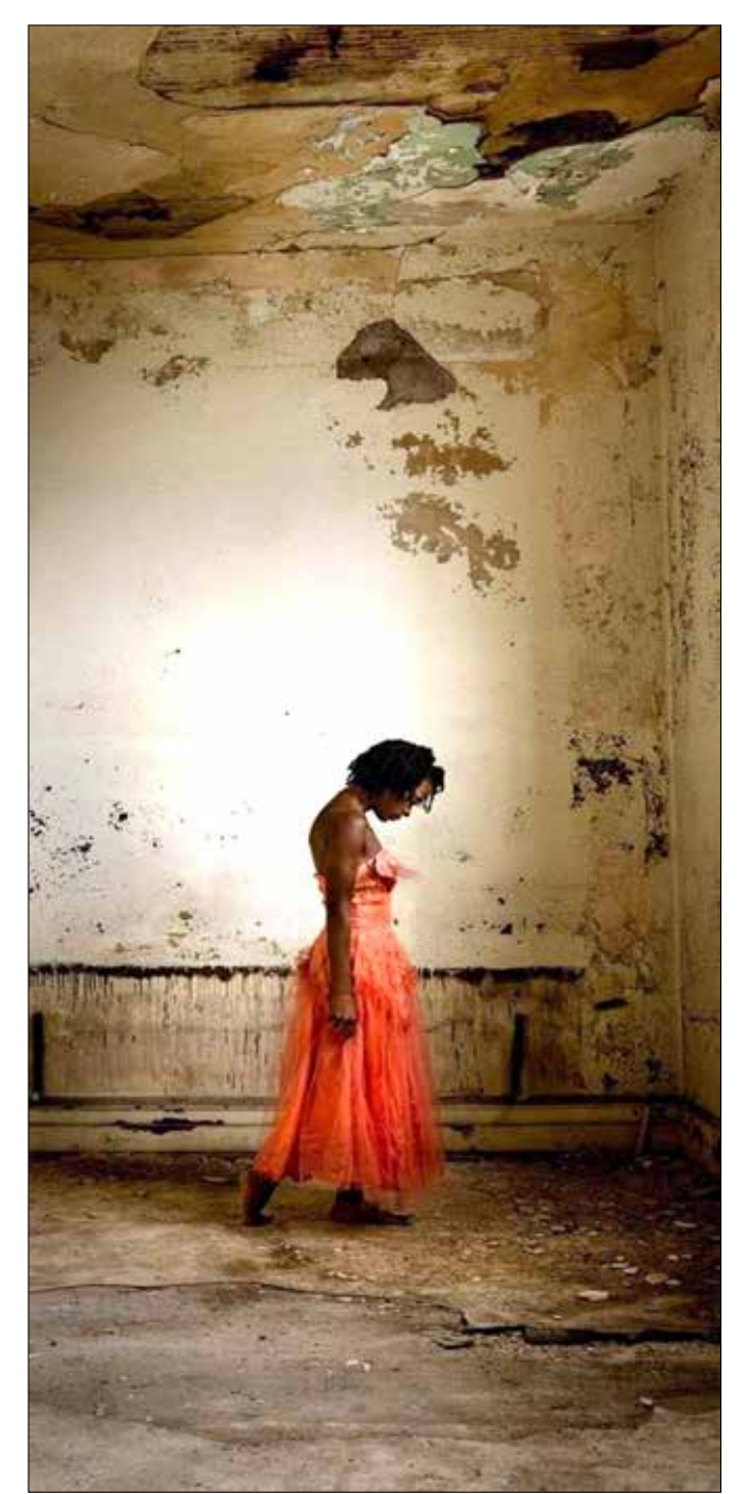
Exhibit dates: May 28 - June 24 Juror: Catherine Hillis Entries deadline: May 6, 4 pm Jurying: May 10, 11 am Notifications by phone or email: May 11 Deadline for delivery of selected work: May 27, 4 pm Awards Selection/Videotape Juror Talk: May 29, 4 pm. /(TBD) First Friday: June 3, noon-8:30 pm (follow safety precautions) Juror Talk/Awards: view on FCCA social media June 3 Pick up hand-deliver work: June 25, or within 10 days Anticipated return shipping: June 25