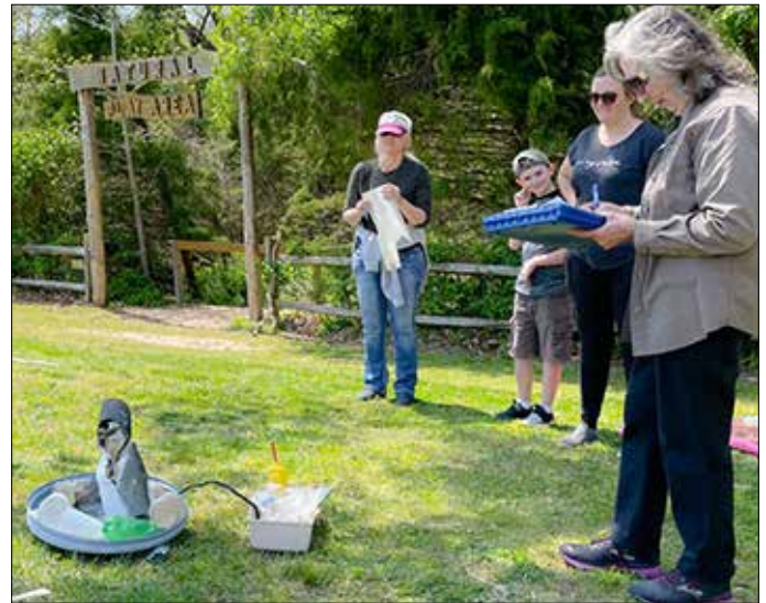
Frederick Gallery Curator, far right, presents best in show to the Colvin family.