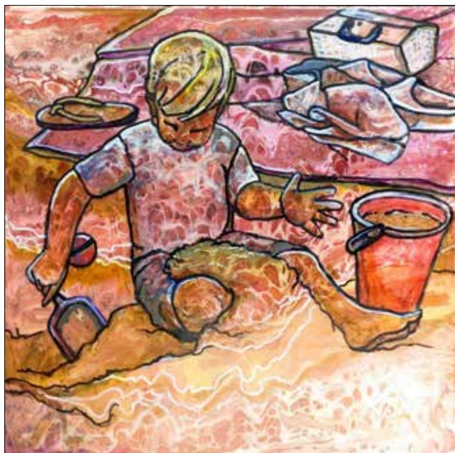
2nd Place: A Day at the Beach, acrylic painting by Sally Rhone-Kubarek , Fredericksburg, Va.

Juror's Talk: https://youtu.be/OBTF-w2eTMU