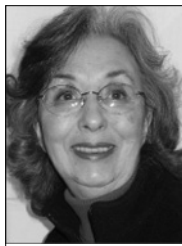
By Carol Morgan Frederick Gallery Curator

Summer arrived in Virginia with high temperatures, storms, and damaging winds, but the FCCA Silversmith House weathered it all with some inconveniences of downed tree limbs, loss of internet and power, along with a broken AC system that now is back in service.